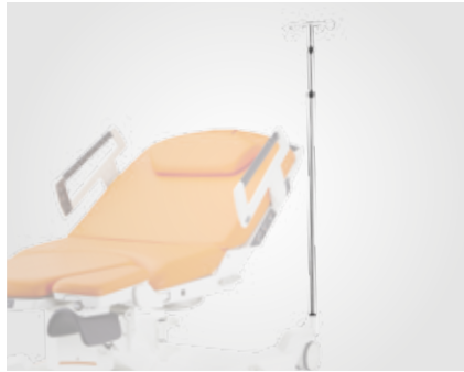
Telescopic infusion stand