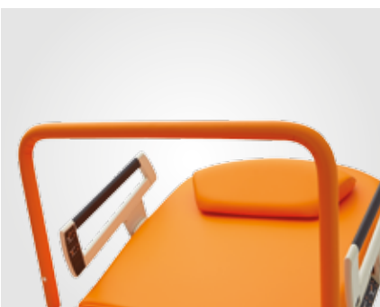
Supporting upholstered bar