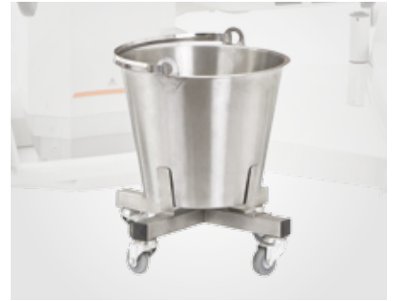
Stainless steel bowl with castors