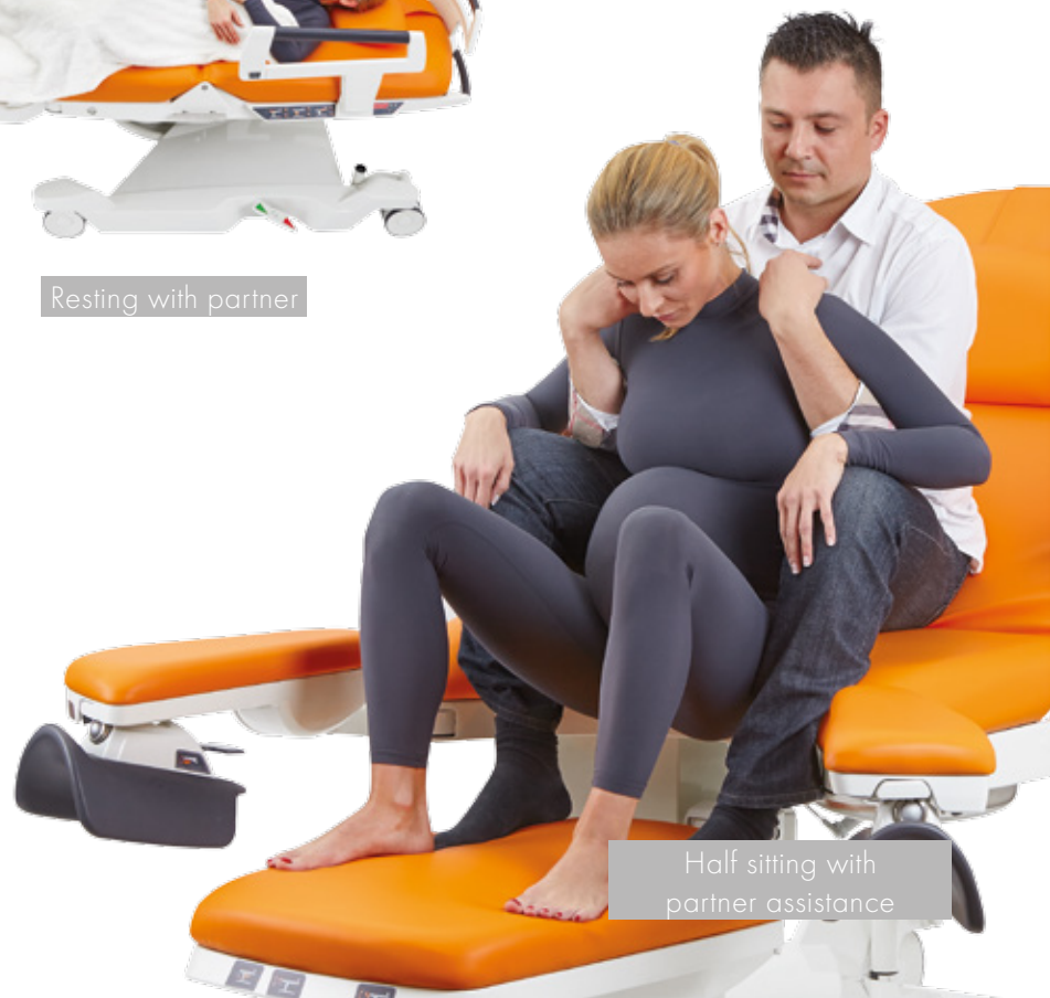
Half sitting with partner assistance