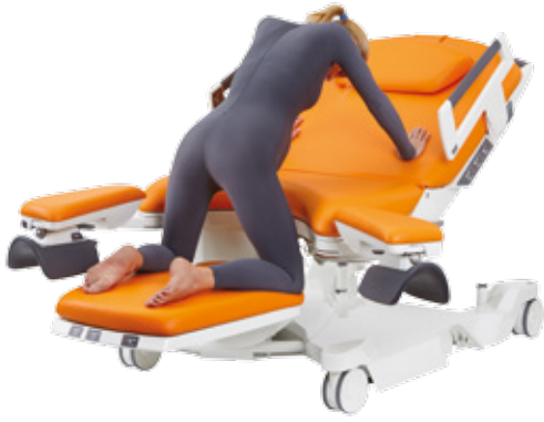
All fours position