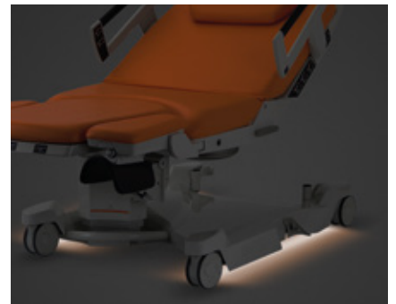
Under bed light