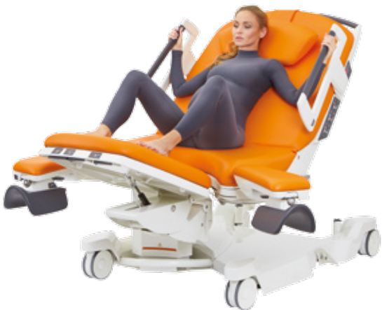
Semi recumbent position with the feet rested on the foot section