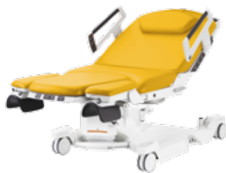
M Corn yellow