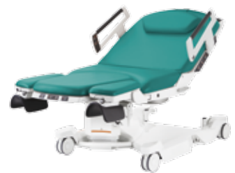
F Ocean green