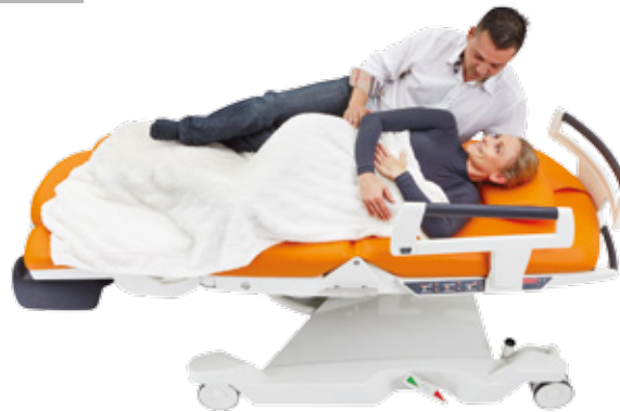
Resting with partner