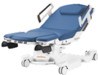
B Brilliant blue