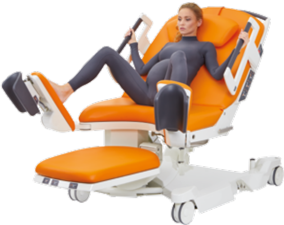
Semi recumbent position with the feet rested on the leg rests