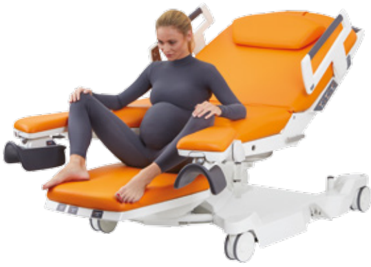
Half sitting using foot section