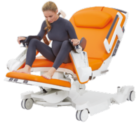
Half sitting using leg holders